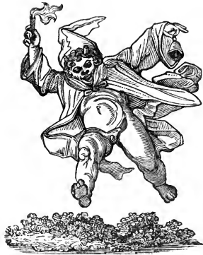
Alter et Idem.